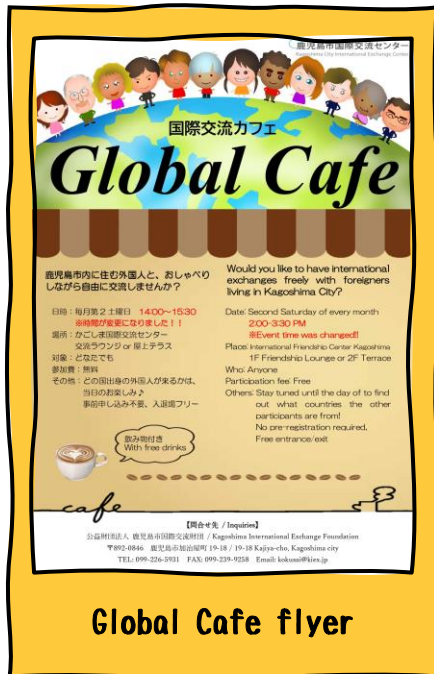
Global Cafe flyer

The Cafe lasts from 2 to 3:30 PM. Drinks are provided!