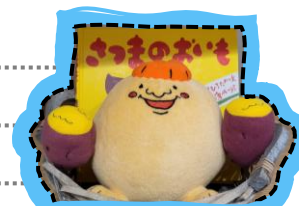
Kagoshima PR Character Marunion

This time we went with Marunion to try out some sweets using satsuma-imo!