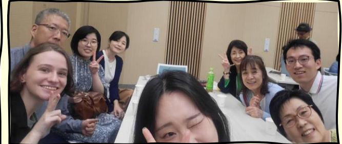
Photo with the members in our last session

Japanese people and foreigners from many countries talk in Japanese, English and more - perfect for those who just came to Japan and those who want to meet new people!