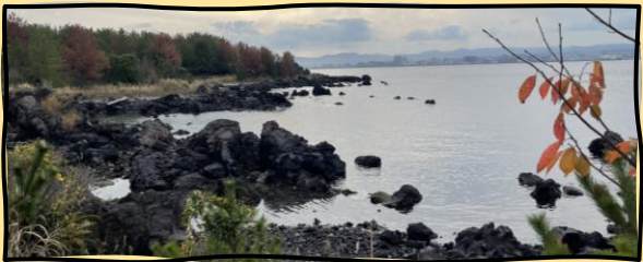
Kinko Bay seen from the trail