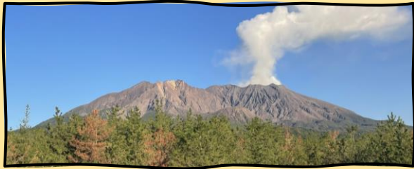
Sakurajima seen from Karasujima Observatory

I will be leaving Kagoshima this March, so for this issue I would like to introduce my favorite place in Kagoshima – Sakurajima Yogan Nagisa Trail!