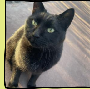
Such pretty eyes!